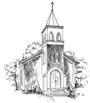
St. Stanislaus, Chatsworth Sunday 9:00 am